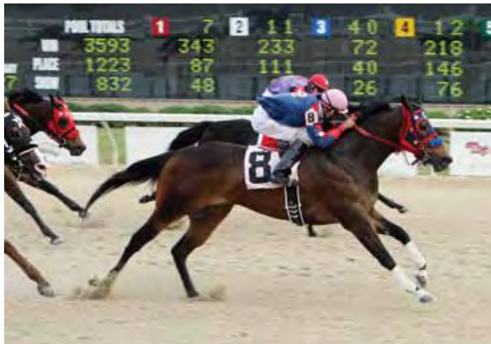
Best Be Onya Game