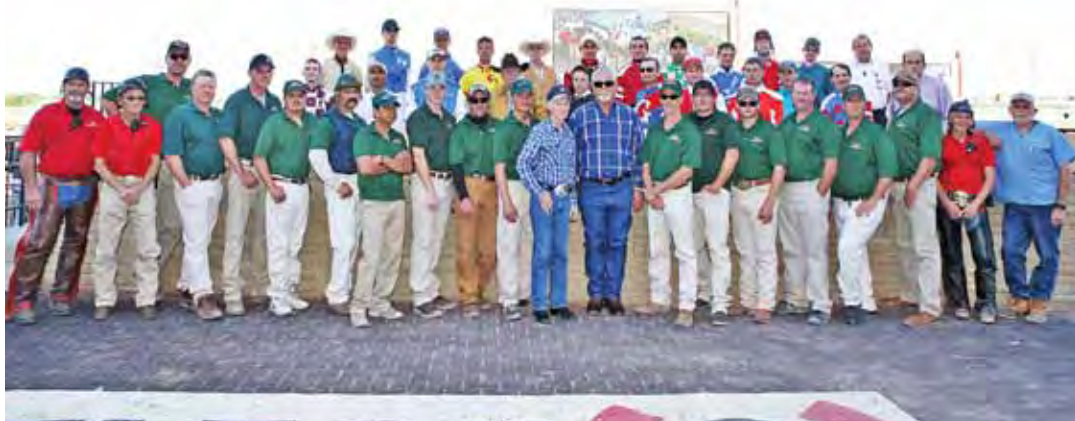
Remington Park recognizes recent heroic efforts of their Starting Gate Crew in special presentation.

A 6-year-old gelding by Tres Seis from the Bully Bullion mare Doctor Prospector,