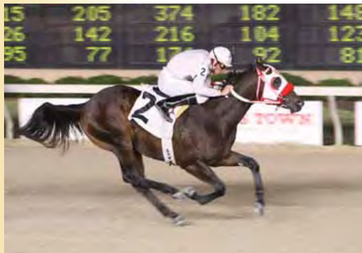
McM Cajun Accent

with a third-place run in the Dowd Mile at Fonner Park.