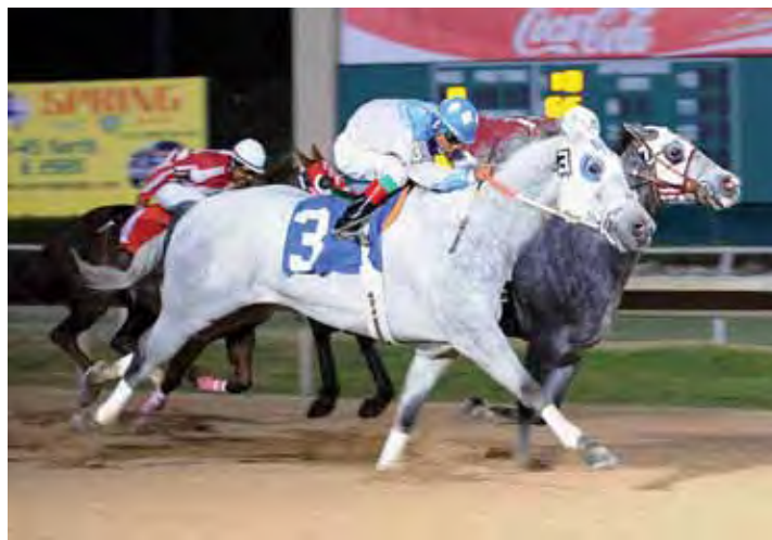
Shake Em Special Pop