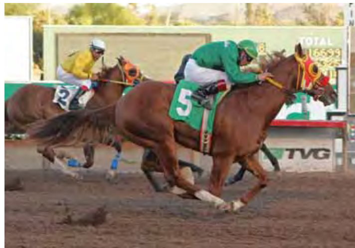
Dukes Red River

4-5 favorite after dominating the three trials in his first start. He won by more than two lengths and his time of :15.702 was easily the top qualifying mark.