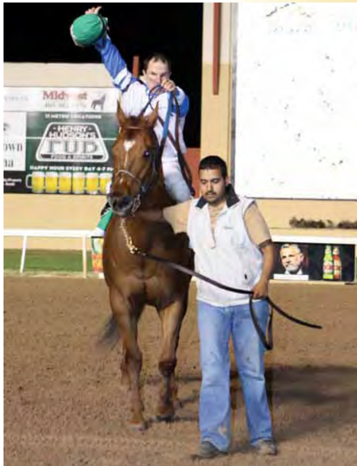
Finche; below, winning connections